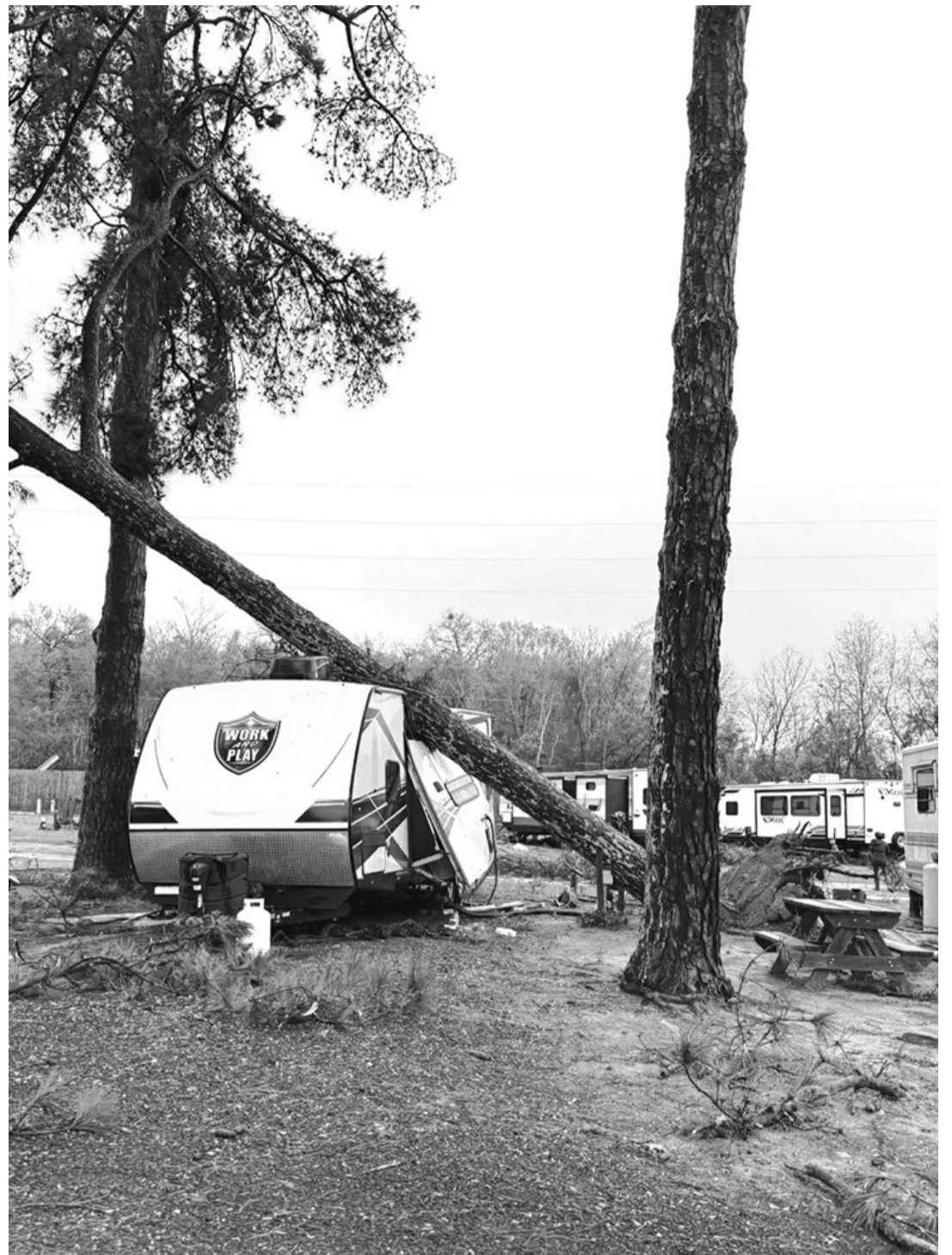
Ponderosa RV park