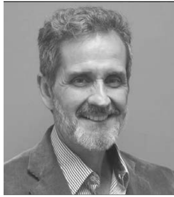
By Wade Yoder IT Columnist

We have an internal survival system, much like we prepare externally for a time of famine or drought, and when something happens that scares our insides such as staying hungry for too long or dehydration, it will prepare itself to protect the body against future stress of this kind.