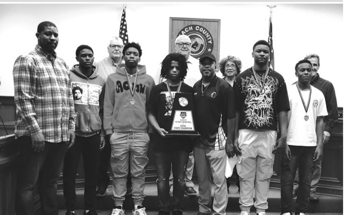
Peach County Parks and Recreation Department's 14U Boys Basketball State Champions