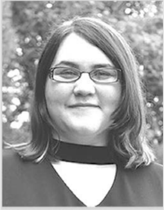
By Zoe Hammond News Editor

Hi my fellow Peach County! There's a difference between discipline and abuse and it seems like many parents cannot tell what that difference is. At least, if the frequent arrests for family violence and cruelty to children charges in the weekly arrest reports are anything to go by. Abuse is not only physical, it can be mental, emotional, sexual, and so on.